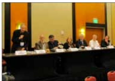
What Works, What Doesn't Panel