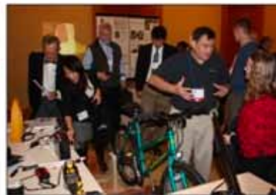
Exhibit Booths and Prototype Displays