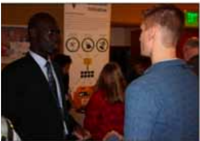
Networking During Breaks